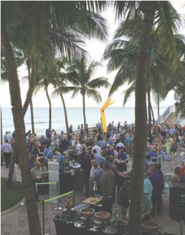
The Connect '15 Opening Reception was held poolside and oceanside.