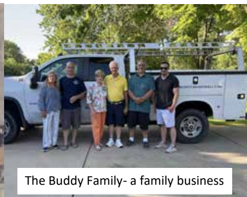
The Buddy Family- a family business