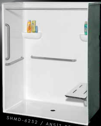
SHMD-6232 / ANSI7-RS/LS